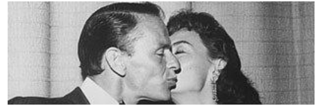
The Academy Awards through the years.