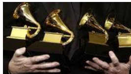
FULL COVERAGE: Grammy Awards 2014