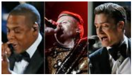
Grammy nominations 2014: The complete list