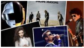
Grammys 2014: Play-at-home ballot