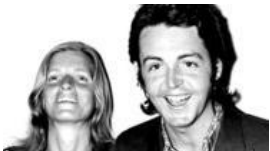
TIMELINE: Grammy winners through the years