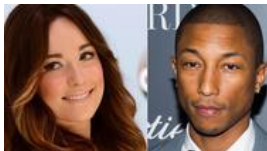
Top nominees