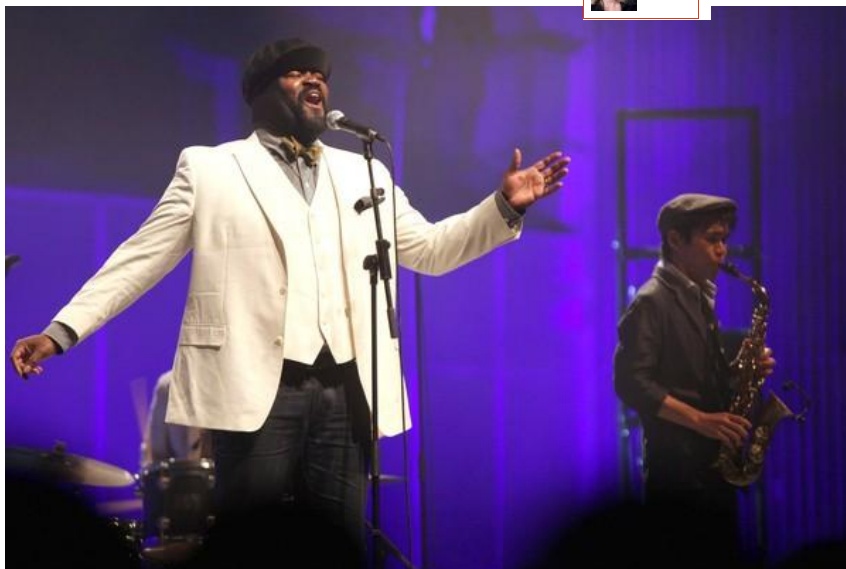
Gregory Porter's "Liquid Soul" was nominated in the jazz vocal category. (Estela Silva / EPA / October 12, 2013)