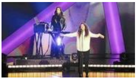
Grammy nominations show puts chaos on display